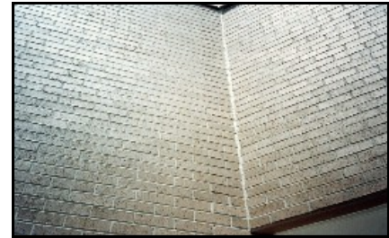
Bricks & pavers sealed with Trojan Ultra